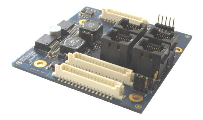
Figure 1: The logiFMC-DispCam Daughter Card

The card utilizes the 160-pin FMC connector (ASP-127797-01).