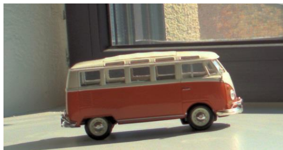
Figure 4: HDR Processed Video Input from Camera