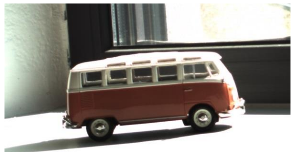
Figure 3: Camera Video Input, Long Exposure