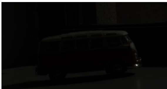
Figure 2: Camera Video Input, Short Exposure

The logiHDR High Dynamic Range Pipeline IP core is an Ultra High Definition (UHD) HDR pipeline designed for digital video processing and image quality enhancements in embedded designs based on Xilinx FPGA, SoC, MPSoC and ACAP programmable devices. It enables processing of raw image data from HDR sensors and is able to extract maximum detail from high-contrast scenes, i.e. scenes with objects highlighted by direct sunlight and objects placed in extreme shades.