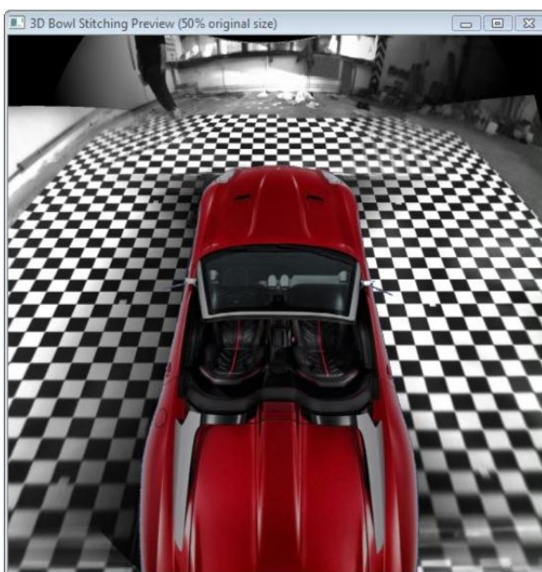
Figure 4: The Calibration Software offers powerfull Preview modes

http://www.logicbricks.com/Solutions/Surround-View-DA-System/Camera-Lens-Vehicle-Calibration-Software.aspx