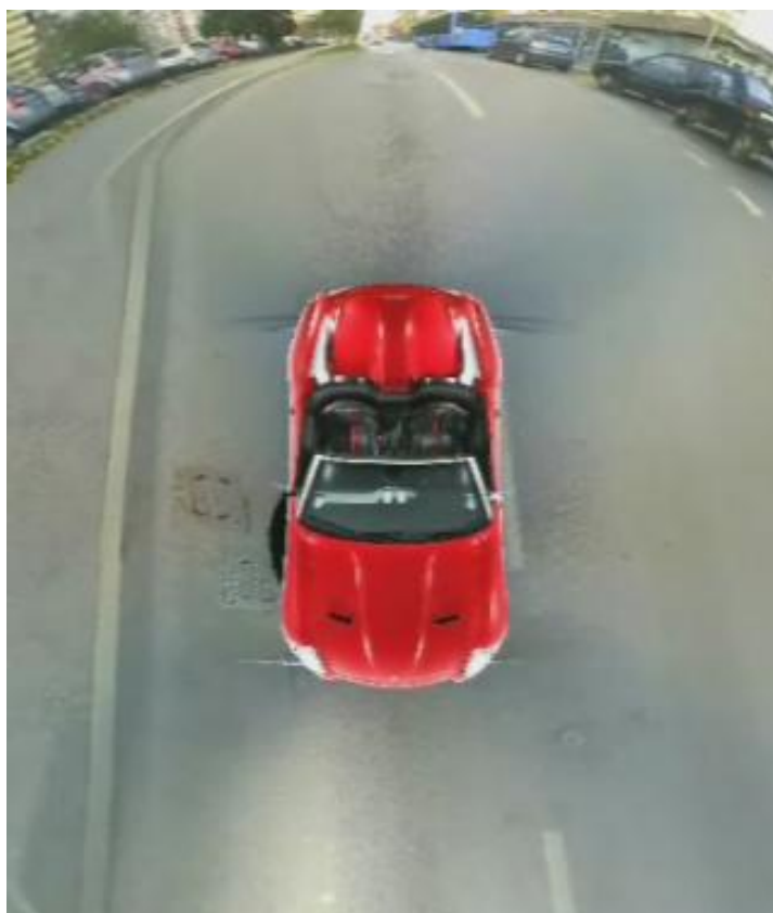
Figure 2: Xylon Surround View DA Demo – One of available views

http://www.logicbricks.com/Solutions/Surround-View-DA-System.aspx