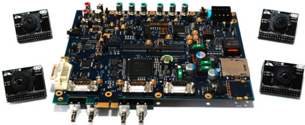
Figure 1: The second-generation logiVIEW-SVK Development Platform for Automotive Surround View DA Systems