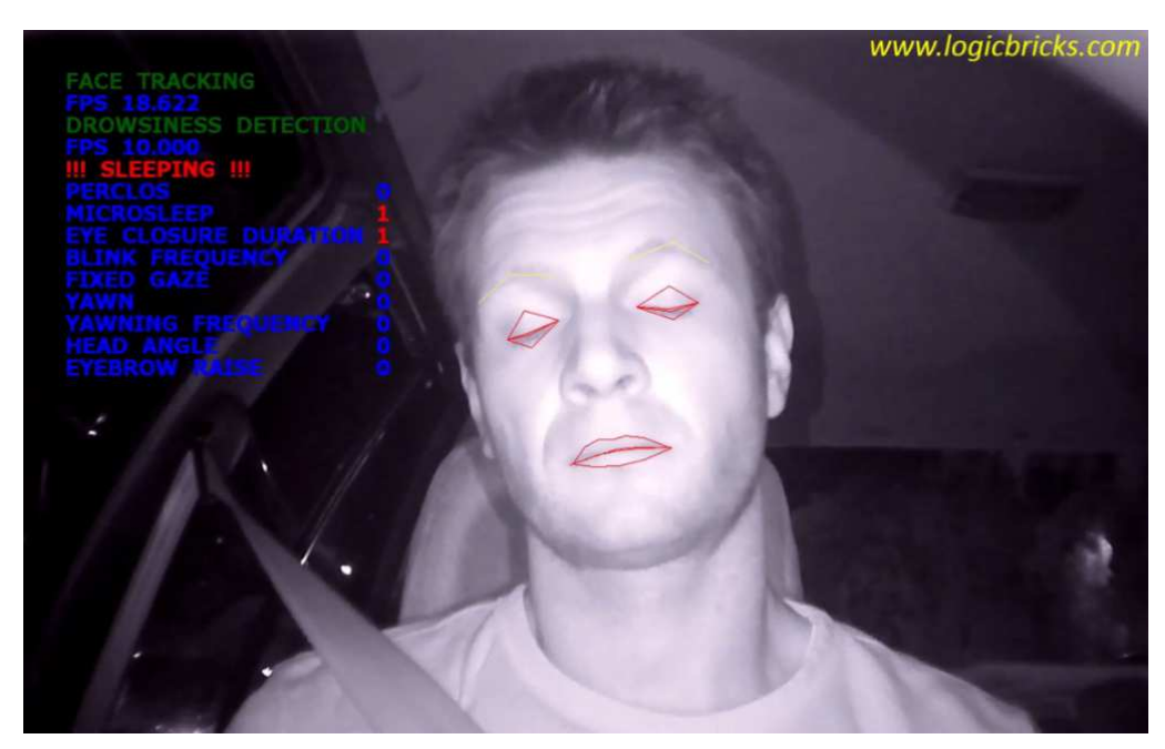
Figure 2: Screenshot from the Xylon Demo System Integrated in a Test Vehicle (Video clip: <a href="http://www.logicbricks.com/logicBRICKS-IP-Library/Video-Galleries/logicBRICKS-Face-Tracking-Demo.aspx">http://www.logicbricks.com/logicBRICKS-IP-Library/Video-Galleries/logicBRICKS-Face-Tracking-Demo.aspx</a>)

The logiDROWSINE IP core is designed and carefully optimized for use in Xilinx Zynq-7000 All Programmable SoC. Digital Signal Processing (DSP) algorithms implemented in programmable logic assure high computing performance and off-load the SoC processing system. The IP core can be controlled by a single ARM Cortex<sup>TM</sup>-A9 CPU core with a lightweight software library. Low resource utilization enables implementation and parallel execution of other ADAS applications on a single Xilinx SoC device.